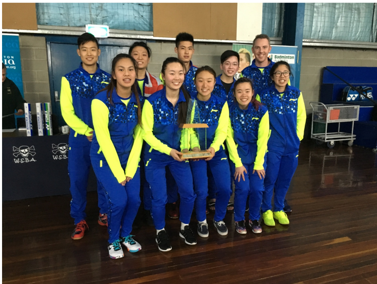
2016 Pan Pac Trophy Winners – Australia Gold