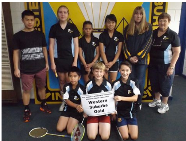
2016 Under 13 WSBA Gold Team