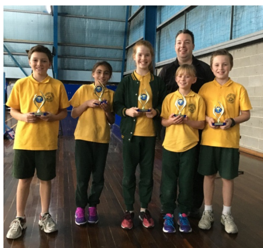
Section 2 Winners Sacred Heart PS No 2