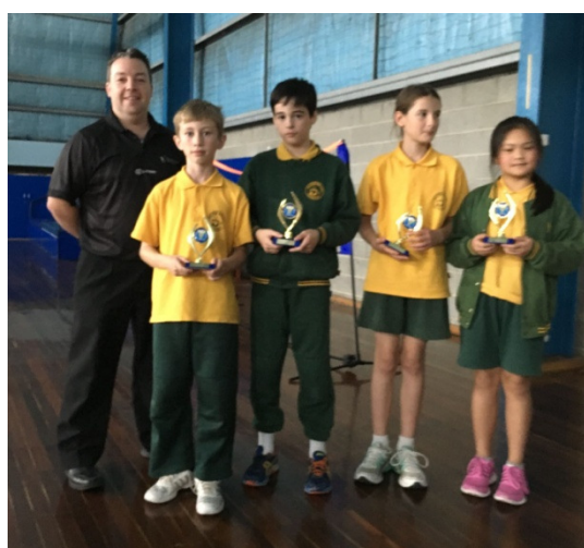
Section 1 Winners Sacred Heart PS No 1