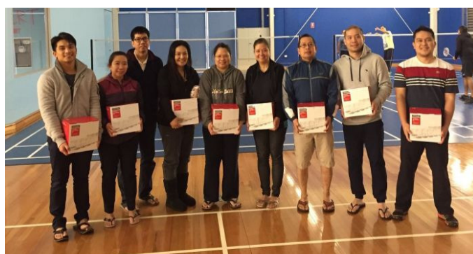
WSBA Suave team