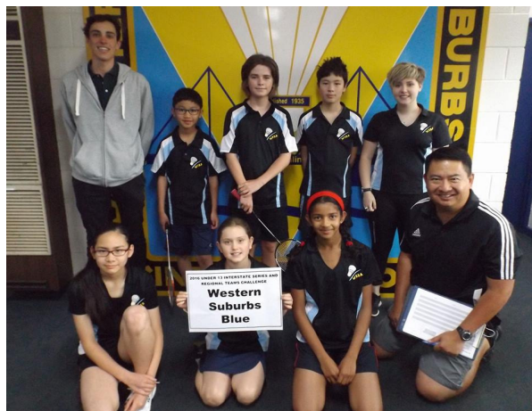
2016 Under 13 WSBA Blue Team