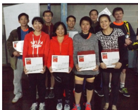
WSBA No Idea team