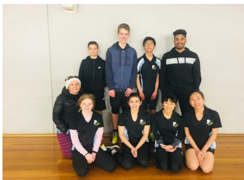
Under 15 WSBA Blue