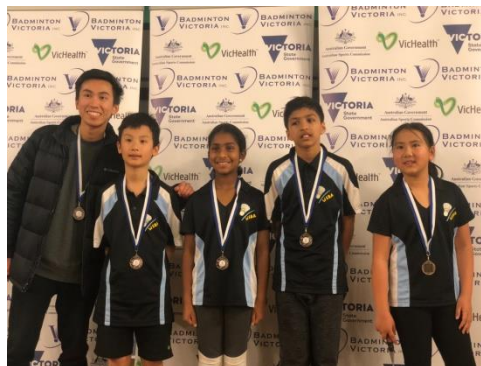
U11 Div 2 – WSBA Blue