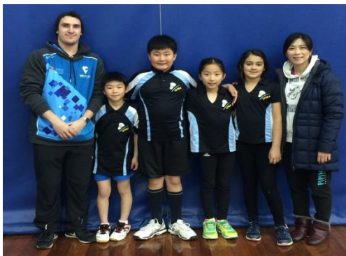
U11 WSBA Gold