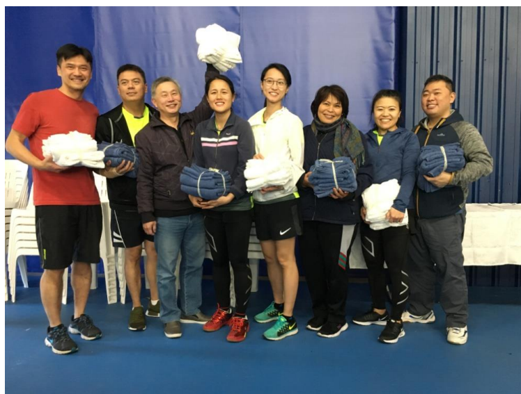
A3 Grade Winners: WSBA Saturday Social