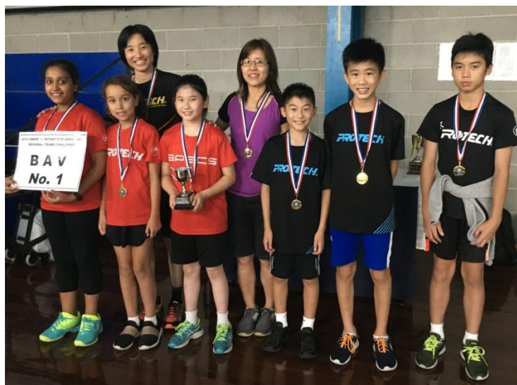
Regional Teams Challenge Winners – Badminton Academy of Victoria #1