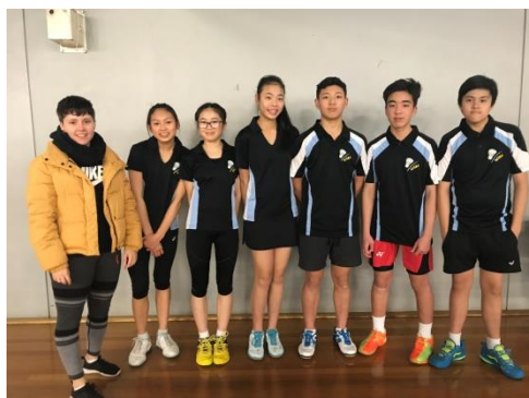
Under 15 WSBA Gold