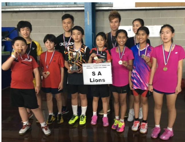
Interstate Series Winners – South Australia Lions