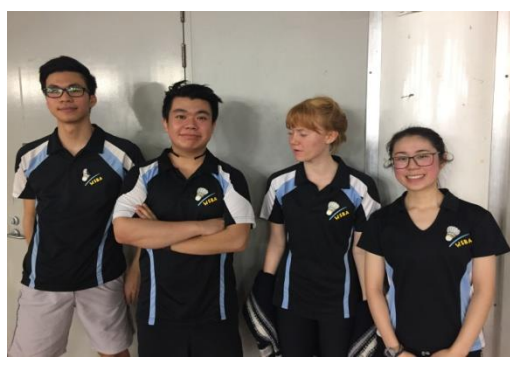
U19 WSBA Team